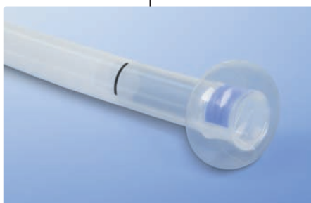
Low pressure retention balloon