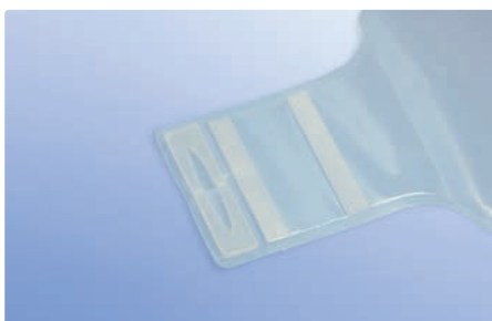
Self-adhesive fold-open top