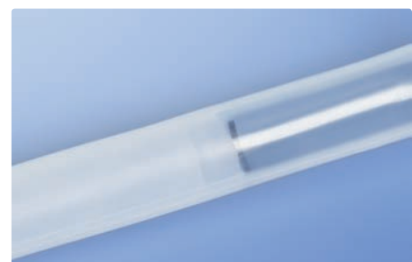
Catheter localisation marks