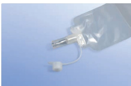
Connector for secretion bag