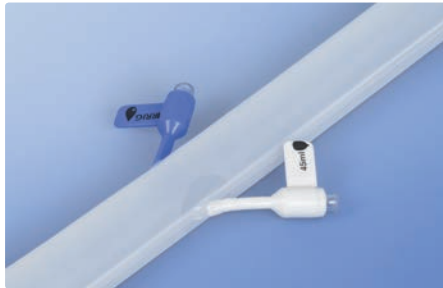
Irrigation (blue) and retention (white) connectors