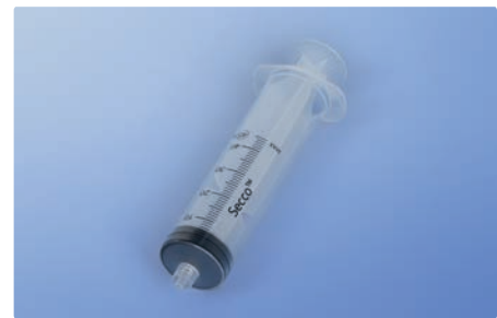
Disposable flushing syringe, 45 ml