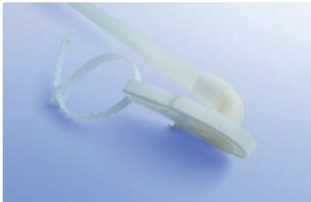
Top panel with velcro strip hanger