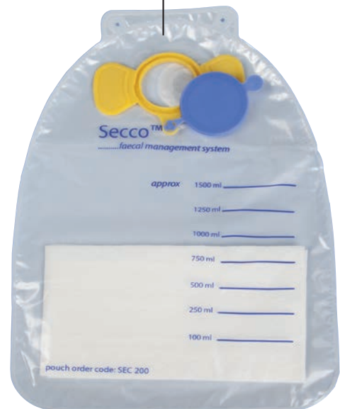
1,500 ml collection bag with super-absorber